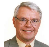
Jean-Arnold Vinois Head of Unit Energy Policy & Security of Supply DG Energy, EC